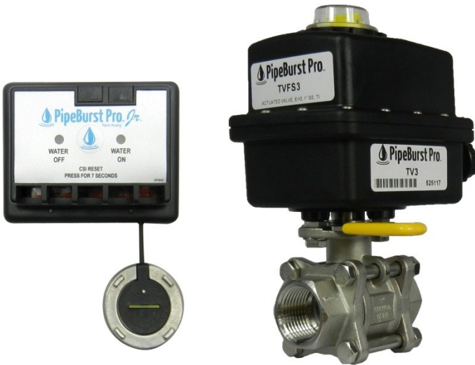
Jr. Starter Kit – JR100