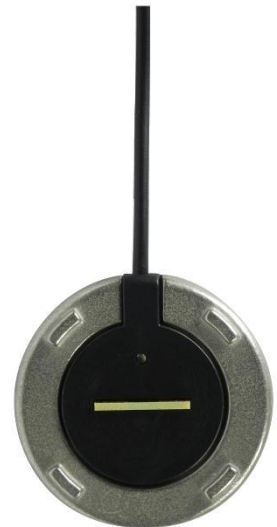
SideKick Part #: SK100B or SK120B