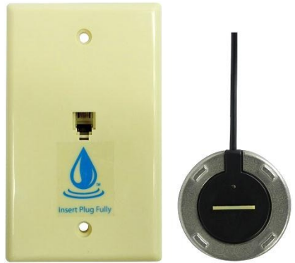
Base Hardware Kit Part #: PB300B or PB300W