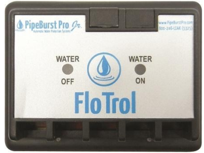
FloTrol Part #: FL100