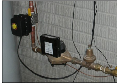
Common TickerValve Installation