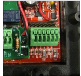
VIP Jr. To FloTrol Terminal Block