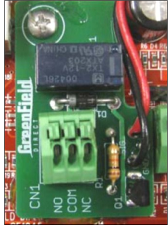
Security System Interface Terminal Block